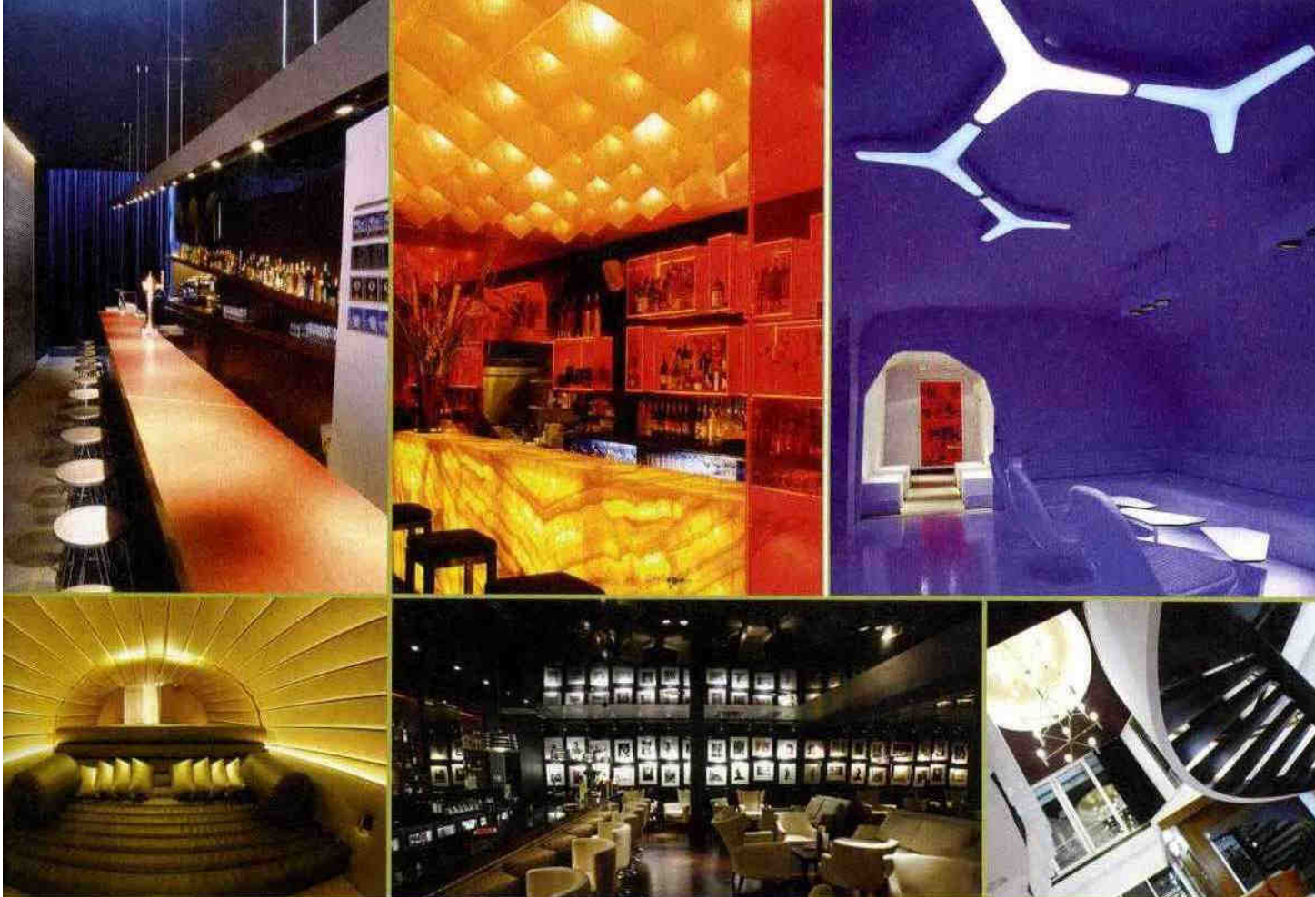
Facing page: Into Lighting's work at Grazia in Shrewsbury. This page (clockwise from bottom left): Into used LEDs extensively throughout Diva Beach in Chelsea; Modular Lighting Instruments supplied The Bar Ateneau in Banyoles, Spain with the SL100 Profile; The Kumo Bar in Knightsbridge was brought to life by Besselink & Jones; Modular's IZAR, a rounded, three-pointed star-shaped light, has been used in the Zuri nightclub on the Belgian coast; Into created the lighting scheme for The Vincent Hotel in Southport, including the bar area.

Northern Lights has recently completed a project for Sunderland Tenpin Bowling. Working with interior designer Bignell Shacklady Ewing, the company sourced and developed a series of contemporary fittings that define the different entertainment areas of the venue, including the bowling lanes, pool tables and bar area. 'Decorative lighting is used more and more as a focal point in leisure venues to make a statement or set the main tone of the location,' says Zhou. To define the bar area, the company used red frosted-glass pendants, which deliver a soft diffusion of light and add a striking element to the area.